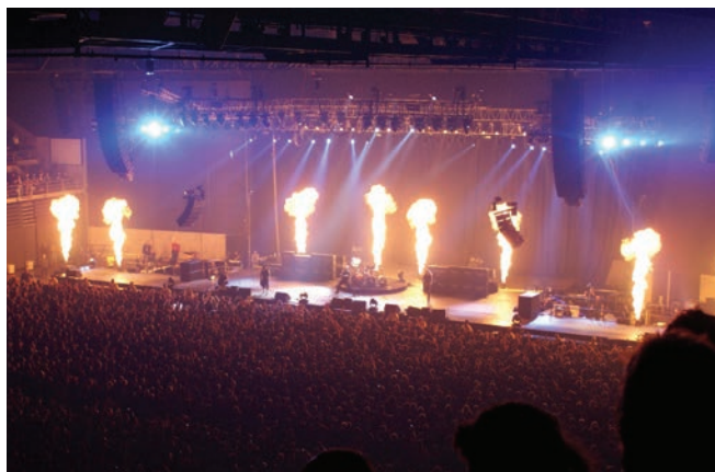
Metallica at CBS Canterbury Arena