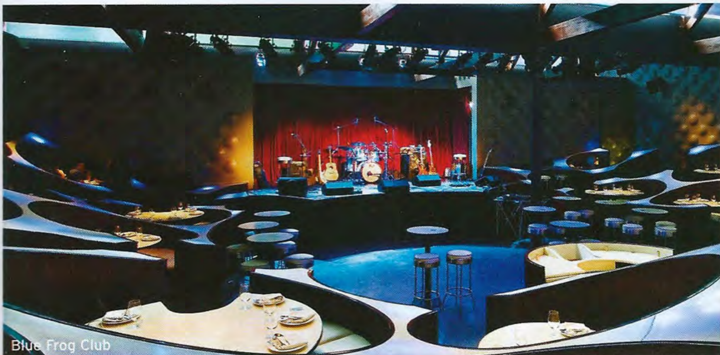
Blue Frog Club

Tuesday, Wednesday, Thursday, and DJs and Electronica acts on Friday and Saturday.